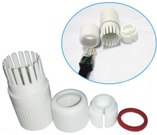
GNT-5313Cover Four set waterproof Cover (Optional)